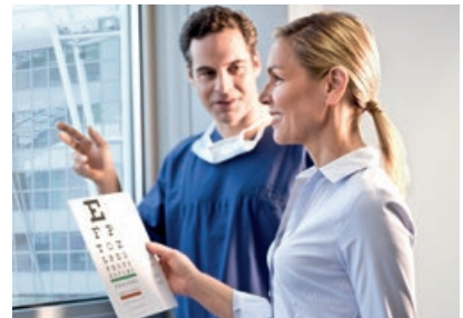
PRESBYOND Laser Blended Vision Customized. All distances. Immediate.

Laser Blended Vision LASIK performed with PRESBYOND is tolerated by a higher number of patients than conventional mono-vision – up to 97% 1 as compared to only 59–67% 2 . In many cases, patients can read without glasses the very same day.