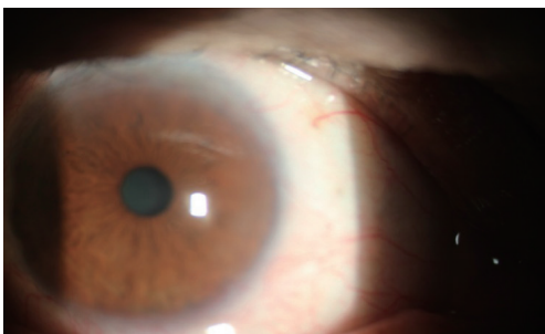
Figure 2 A case of no corneal neovascularization in group B.

burning sensation, however 2 eyes in group A revealed graft necrosis.