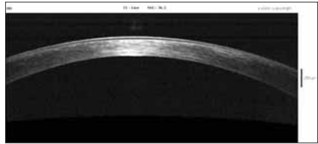
Figure 2. Corneal optical coherence tomography of the same eye as in Figure 1 taken 7 months after the Athens Protocol. Note the anterior corneal hyper-reflectivity consistent with CXL and the demarcation line at a depth of about 300 \mu\text{m} depicting effective CXL.

We also introduced the theory that the PRK-treated eye represents a better biomechanical model on which to perform CXL. 8-10 Hypothetically, an eye with a more regular surface would be better strengthened using CXL and would be more likely to remain stable after the procedure. This is in comparison to an eye that has ongoing strain from raised IOP and localized eye rubbing over the cone's peak. We believe that the redistribution of corneal strain through remodeling using surface ablation is a significant factor in the synergistic effect achieved when the two procedures are performed together. The simultaneous technique also avoids the removal of cross-linked corneal tissue, which occurs when CXL is performed before the laser treatment.