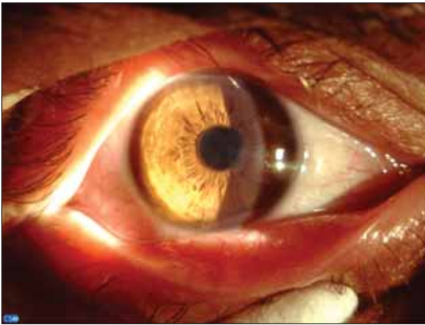
Figure 1. A clinical photograph (OD) of a 27-year-old man with advanced keratoconus. His preoperative BSCVA was 20/50 with -2.50 -5.00 X 80. He underwent treatment according to the Athens Protocol and now has a UCVA of 20/30 and a BSCVA of 20/20 with -1.00 -1.50 X 85. The slit-lamp photograph shows the corneal clarity and ground-glass appearance typical of CXL.

normalize the corneal surface. In support of our rationale for performing the two procedures simultaneously with the ablation first, data have shown that the corneal epithelium and Bowman membrane can act as barriers to the penetration of UVA light into the stroma. 7 Because phototherapeutic keratectomy/PRK removes the epithelium and Bowman membrane, it seems intuitive that the efficacy of the CXL procedure would increase. This concept is supported by clinical findings. 8-10