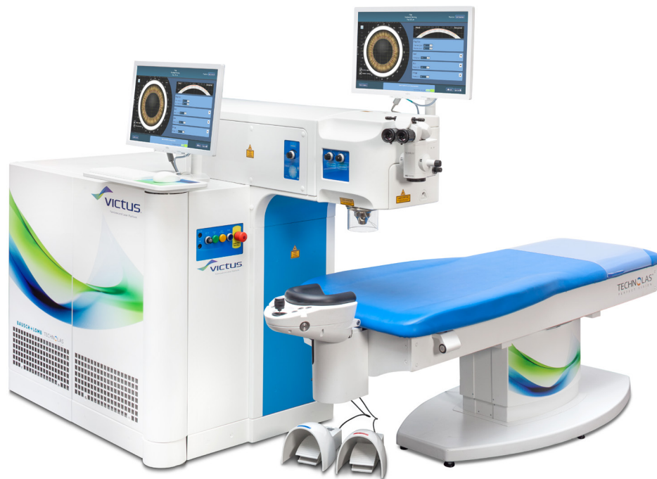
VICTUS® femtosecond laser

But how do these various Bausch + Lomb technologies come together to complement each other? One example is the ability to create any type of opening for cataract surgery to fit your equipment, which in my case is the MICS handpiece for the Stellaris® system (Bausch + Lomb). The perfect fit for my phaco