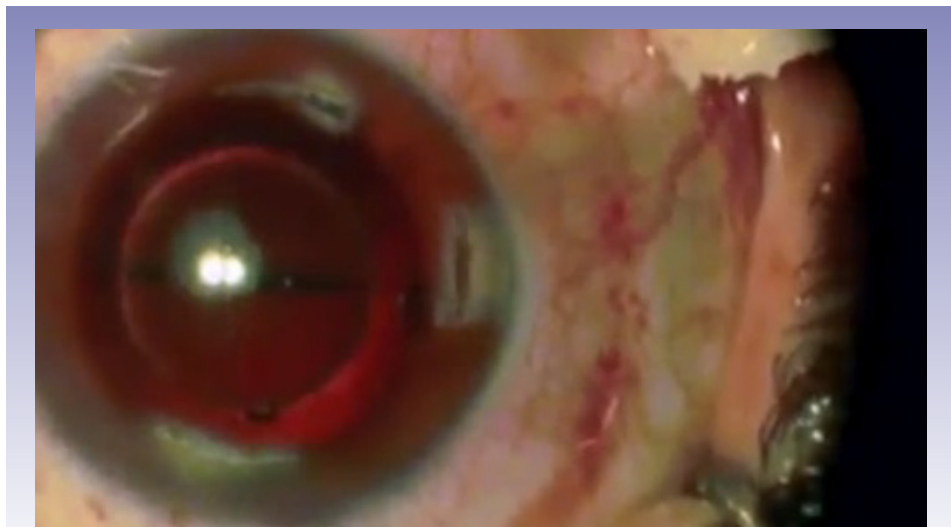
Eye following VICTUS® femtosecond laser use to create incisions, capsulotomy, and lens fragmentation prior to cataract removal. Of note is the lack of a "white ring" around the anterior capsulotomy. Less adhesion to the cortex becomes important during I/A to help ease removal.

The system allows us to compensate for individual patient challenges in new ways. If I see a patient who is moving and endangering